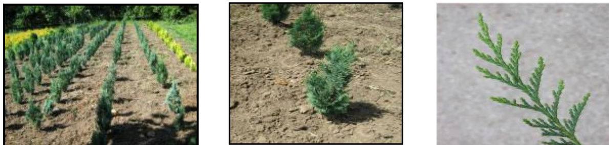
Foto.1. Chamaecyparis lawsoniana 'Blue Pyramid' (A. Murr.) Parl (original).